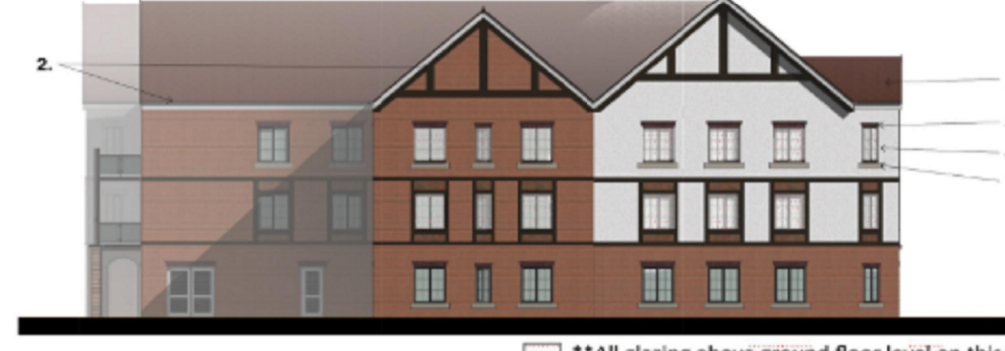
Block B - West Elevation 1 : 200