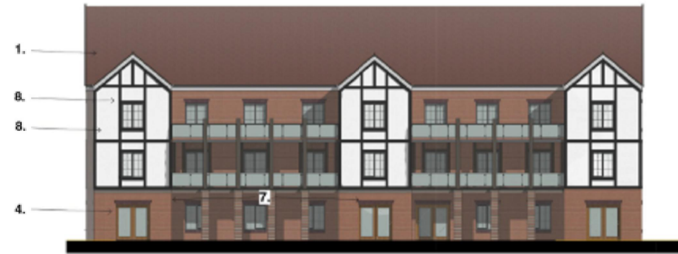
Block B - South Elevation 1 : 200