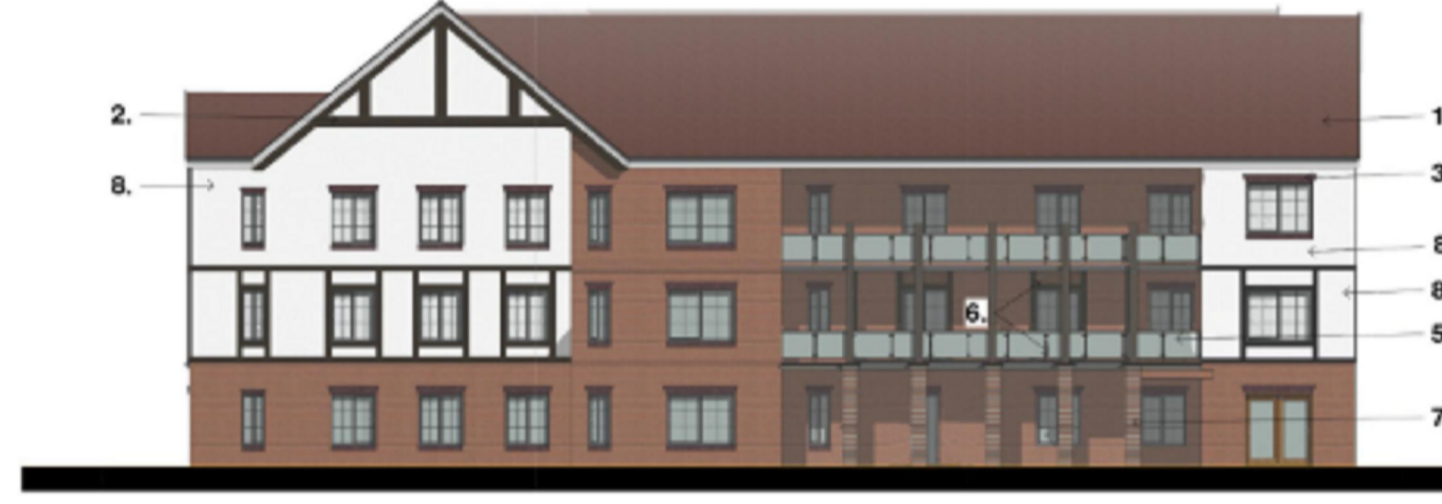
Block B - East Elevation 1 : 200