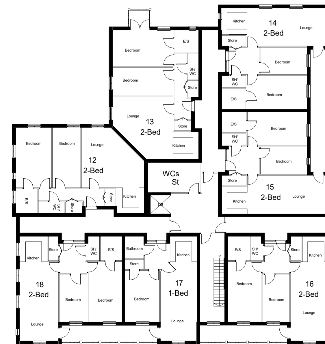
Proposed Second Floor Plan 1 : 200