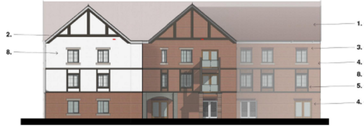
Block B - North Elevation 1 : 200