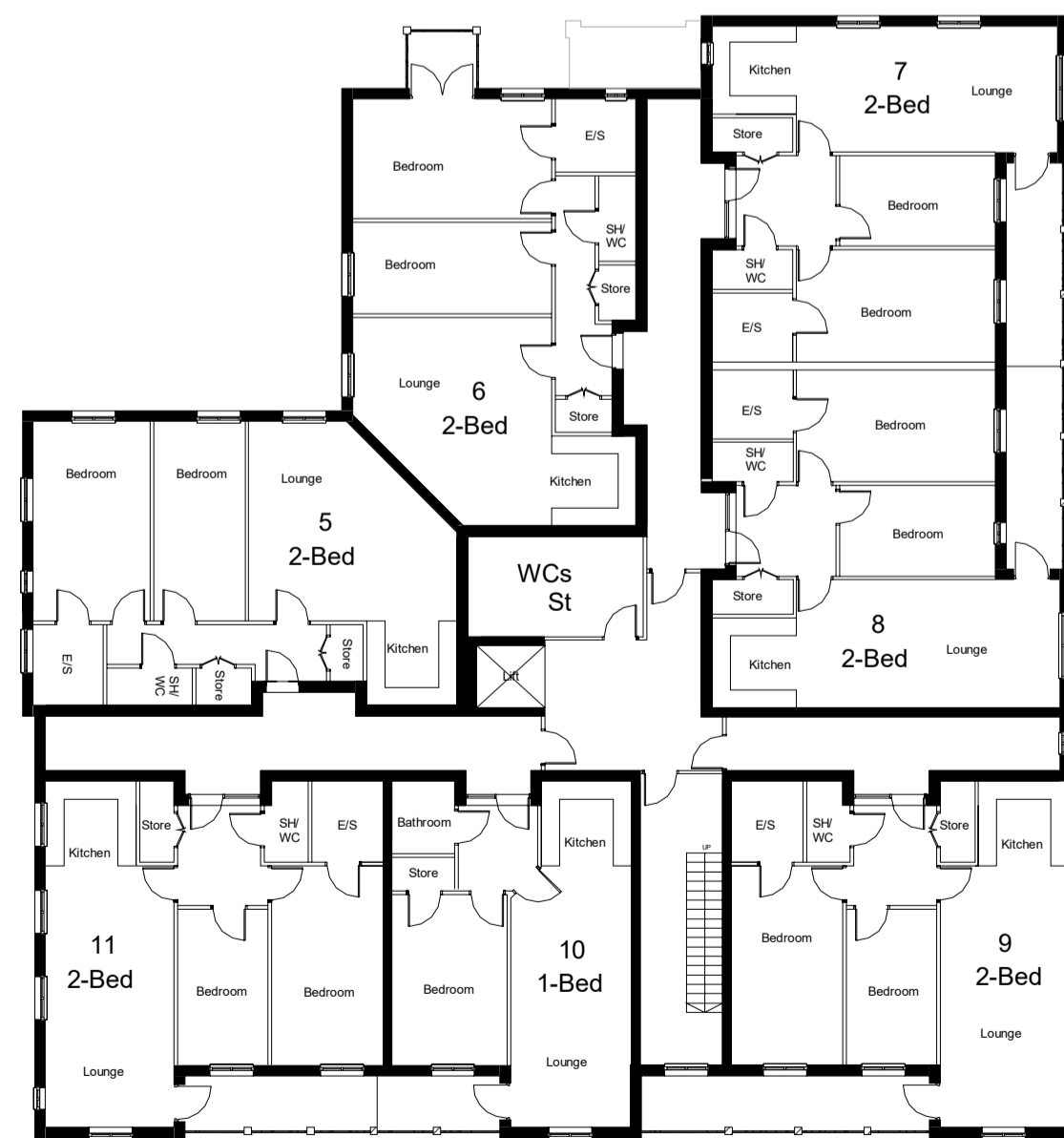
Proposed First Floor Plan 1 : 200